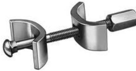
Worktop fixing bolt

Timber is a natural product and may vary in colour. The colour may vary over time with natural ultra violet light. This may depend on the finish used, as some may have UV inhibitors within the treatment.